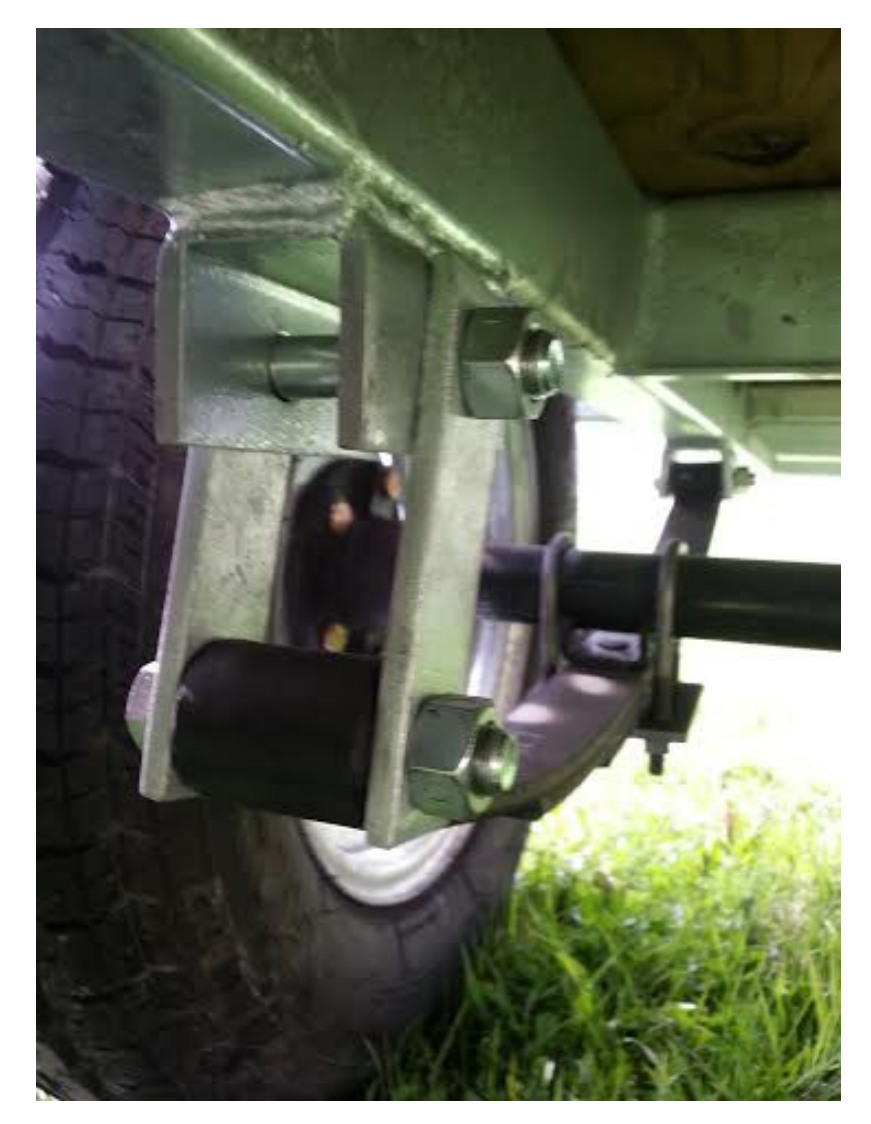
Rear shackle with shackle links

Shackle closest to the front of the trailer