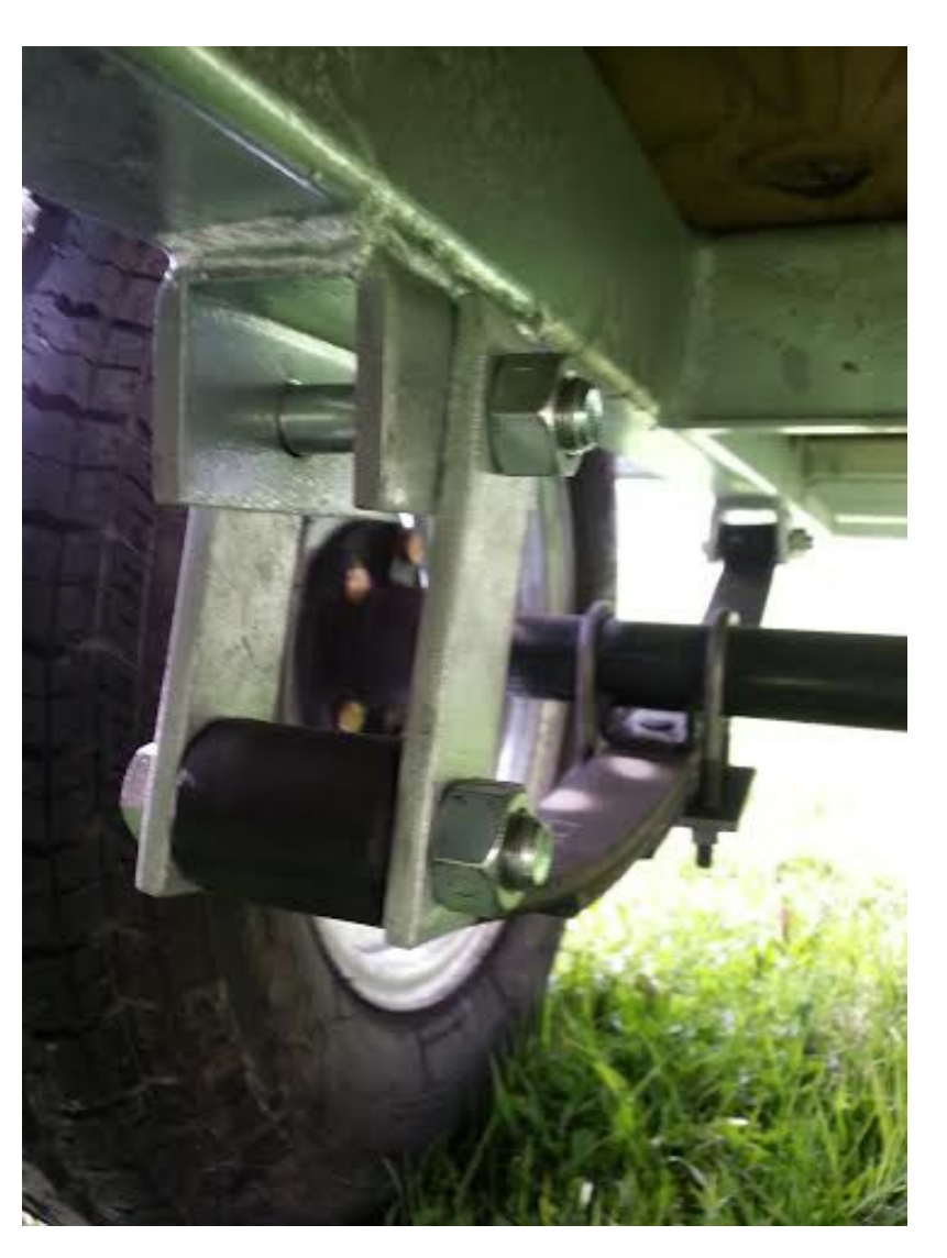
Rear shackle with shackle links