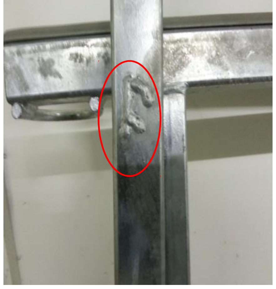
"R" for Rear Rack and "F" for Front Rack